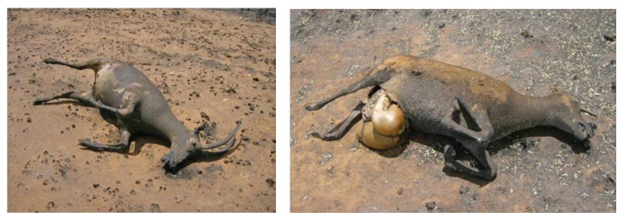
The size of a farm/camps are very important when choosing a farm or fencing, as the risk of mortalities due to fire increases as camp size decreases. Pictured are sable burned to death. It is also wise to clear corners of all camps from grass and bush as a safety precaution for wildlife.