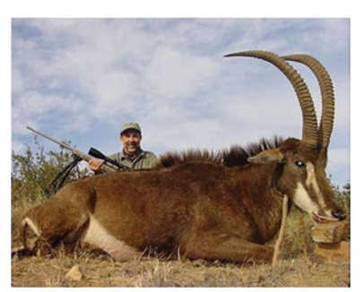
This sable in Cookhouse area changed colour from black to red – confirmed as copper deficiency