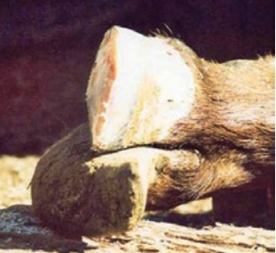
With very sandy soils, animals' hooves could grow too long.

rhebok, klipspringer, kudu, mountain reedbuck, oribi, ostrich, red hartebeest, reedbuck, white rhino, springbok, steenbok, warthog, black wildebeest, blue wildebeest, Burchell's zebra.