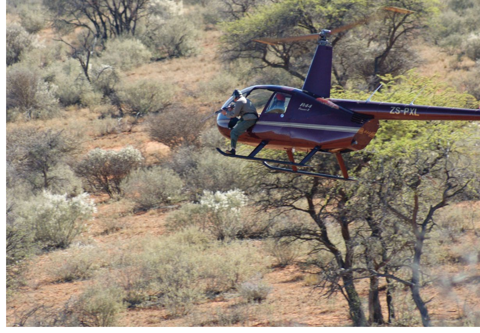
Tall trees make darting from a helicopter difficult, while the bushes are more suitable for boma capturing.

and eland are susceptible to heartwater but there are exceptions.