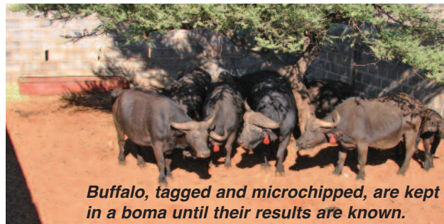
Buffalo, tagged and microchipped, are kept in a boma until their results are known.