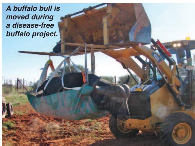
A buffalo bull is moved during a disease-free buffalo project.

WARNING: I think it is important to warn all fellow game ranchers about the real danger of hand-rearing all species of game, especially the males. When it comes to wild animals, there is no such thing as a tame, hand-reared male! I know of many casualties due to injuries by springbok, duiker, mountain reedbeek, black wildebeest, impala, kudu, eland and buffalo. If you rear any wild male animal, break human contact as soon as it is weaned and release it back into the wild. I cannot overemphasise the importance of this – many people could still be killed or injured if they do not heed this warning.