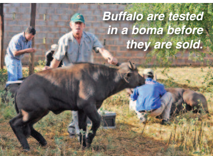
Buffalo are tested in a boma before they are sold.