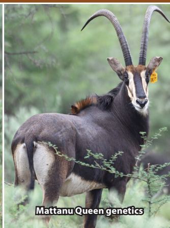
Mattanu Queen genetics