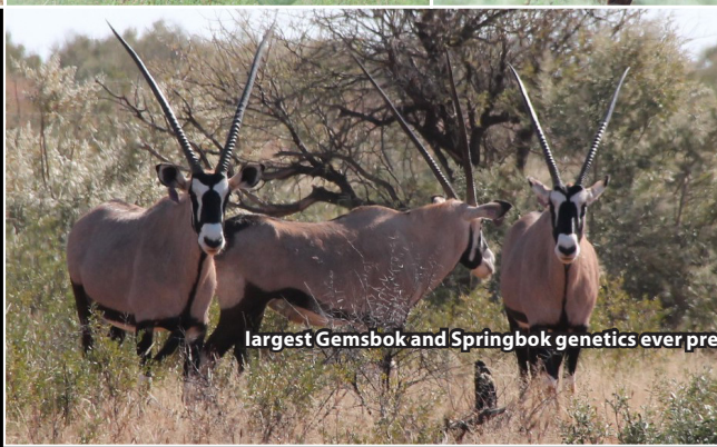
largest Gemsbok and Springbok genetics ever presented on Auction in SA.