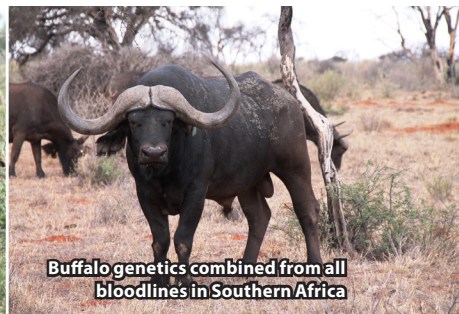
Buffalo genetics combined from all bloodlines in Southern Africa