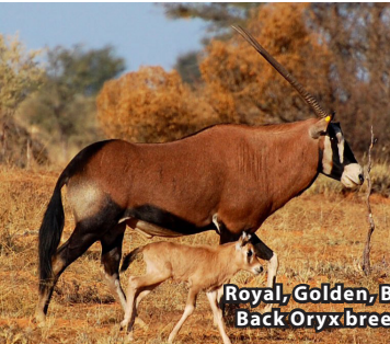
Royal, Golden, Black and Saddle Back Oryx breeding programs